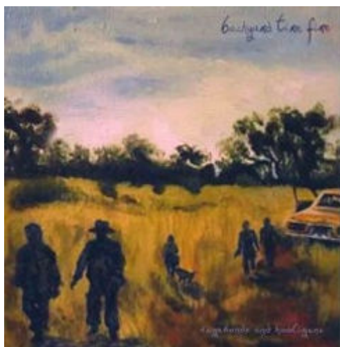
Backyard Tire Fire Appearing June 21, 7 - 9 p.m.