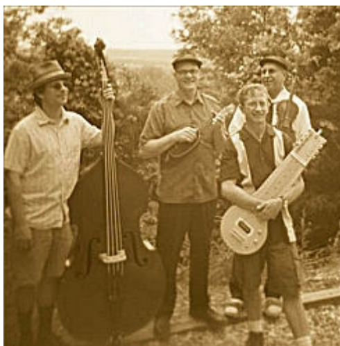
The Bait Shop Boys Appearing June 7, 7 - 9 p.m.

This great local band was formed when members of the Mudbugs and the Night Crawlers came together to play what they call "hillbilly jazz." Most of their members were discovered playing on street corners so they'll be glad to hear we've closed off an entire street for them!